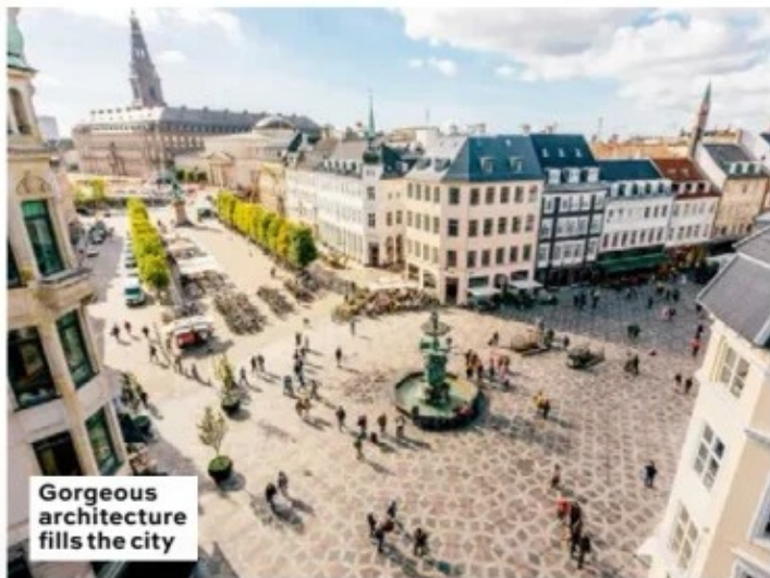
Gorgeous architecture fills the city