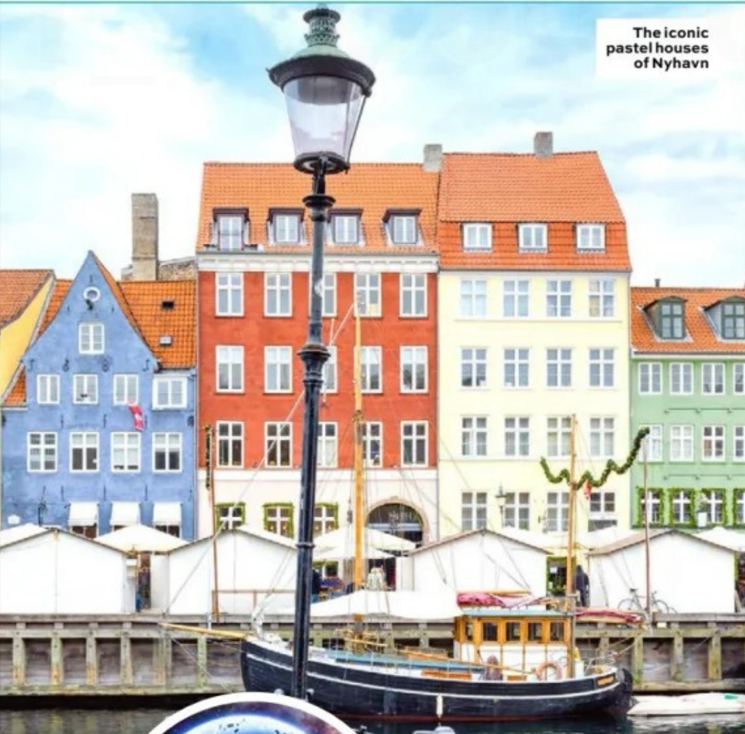
The iconic pastel houses of Nyhavn