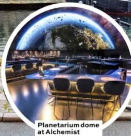
Planetarium dome at Alchemist