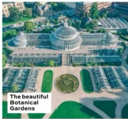
The beautiful Botanical Gardens

Forward-thinking Copenhagen's a treasure trove of gorgeous architecture, Scandi design and no-fuss fashion. Its cycling culture is strong – you'll definitely want two wheels rather than four as it's the quickest and easiest way to explore neighbourhoods like historical Indre By and chic Frederiksberg. Must-see sights include the Botanical Gardens; primary-coloured, 17th-century Nyhavn waterfront; and Tivoli Gardens, the twinkling fun fair in the heart of the city (and one of the oldest in Europe), which reopens every Spring.