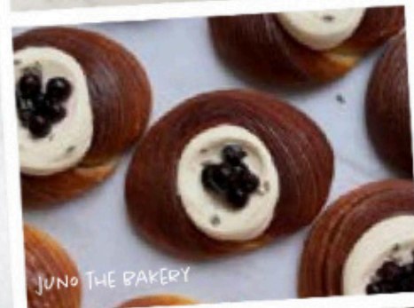
JUNO THE BAKERY

Ingredients are treated with respect, dishes are composed with restraint, and the experience feels immersive without being theatrical.