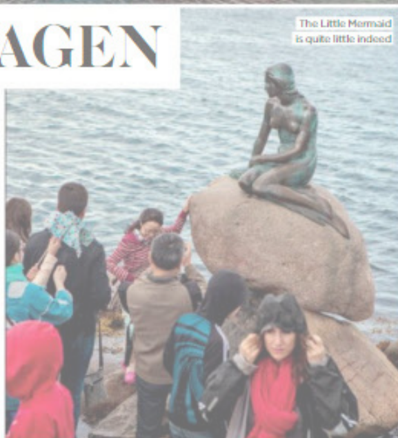
The Little Mermaid is quite little indeed

Those lucky Danes, apart from the weather (although when you've got sartorial layering down to a tee, what do you care) and the taxes, Copenhagen is a right-on city which intends to be carbon-neutral by 2025, with fabulous food and design at its coolly beating heart. The short hop from London and 15-minute train journey straight into the centre of town mean you can be sitting down to a seven-course tasting menu at Mielcke & Hurligtigkøl in the beautiful Botanical Gardens, eyeing up the well-groomed Danes, even if you had to put in a full day at the office. Just new to the hotel scene, which is oddly lacking in wowsy addresses, is Hotel Sanders, the 104-room place from the dishy, former prima ballerina, Alexander Kølpin. It's the antithesis to the glitzy, old-money Hotel d'Angleterre and appeals to the inconspicuously wealthy who love a Soho House-type vibe. At the other end of the spectrum, you could easily hole up for a couple of nights in the Andersen, just a five-minute walk