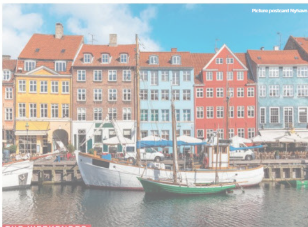
Picture postcard Nyhavn