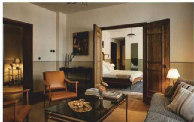
The spacious Sanders Apartment at Hotel Sanders

Part of the new Radisson Collection brand, this eye-catching property was designed by modernist architect Arne Jacobsen in the 1950s, and was known as SAS Royal Hotel. Following a full refurbishment, the curvy furniture and egg chairs pay homage to the building's place in design history, while there are a handful of signature suites fitted out to reflect the style of famous architects.